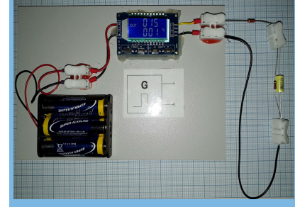
RC model Biomembrane