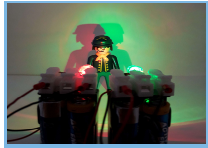
Light and shadow